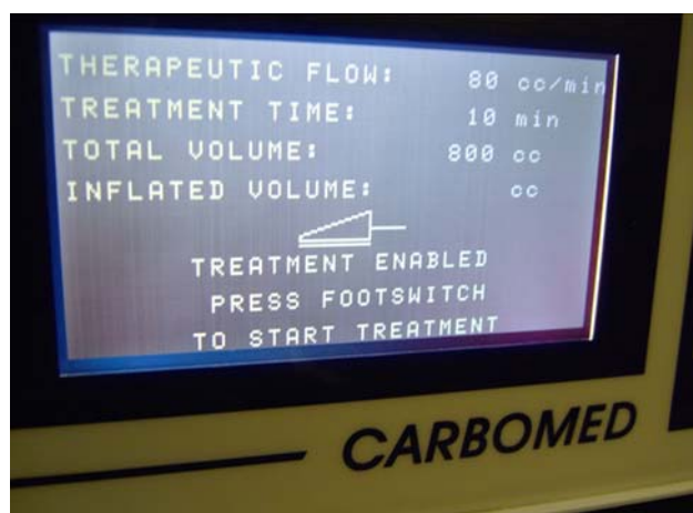
Fig. 1 Front panel of the Carbomed Programmable (CO 2 ) apparatus

The complications were minor and included pain at the injection site as well as crepitus and minor aches, which did not last more than 30 min. Some needle-entry bruising was noted, which resolved within 7 to 10 days. No other side effects were observed.